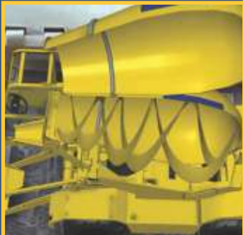
Double Helical Arrangement with low inclination of drum for better mixing.