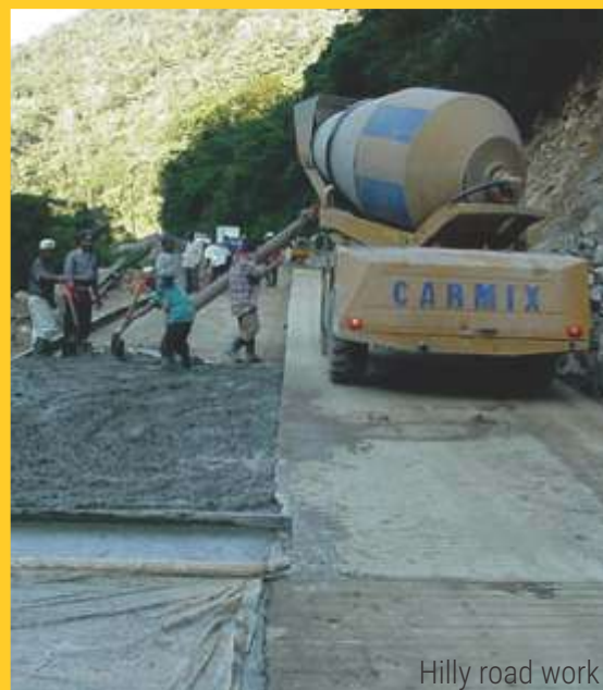
Hilly road work