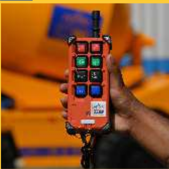
Ground control through Remote for Drum Swivel, Drum Mixing & Discharge, Discharge Chute Up/Down and Auto Water Cutoff as per requirement. (4.3 TT only)