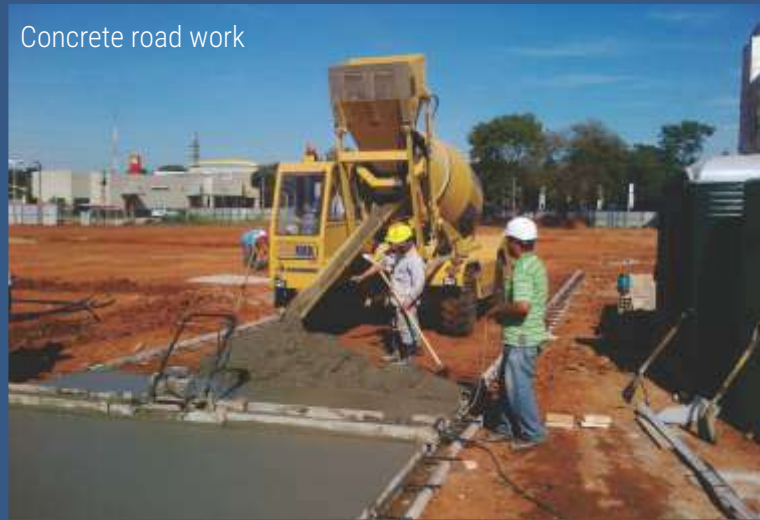
Concrete road work