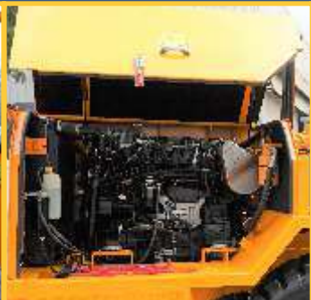
Easily Accessible Engine compared to various other mixers available in the market.