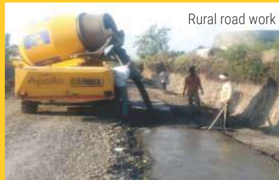
Rural road work