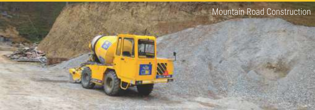
Mountain Road Construction