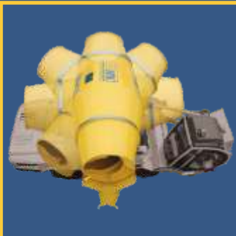
270° Drum Rotation to discharge concrete on all 4 sides of the machine.