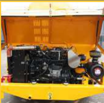
Easily Accessible Engine compared to various other mixers available in the market.