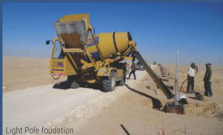
Light Pole foudation