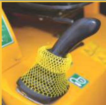
Joystick Operations for all main functions of loader for operators ease.