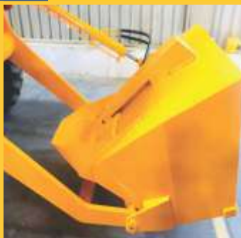
V- Shape articulated bucket with Hydraulic Shutter Gate to avoid spillage & better loading.