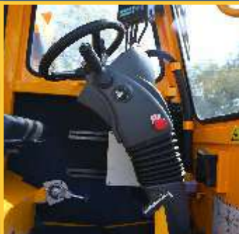
Height and inclination angle adjustable Ecomatric Panel, comfortable for operator.